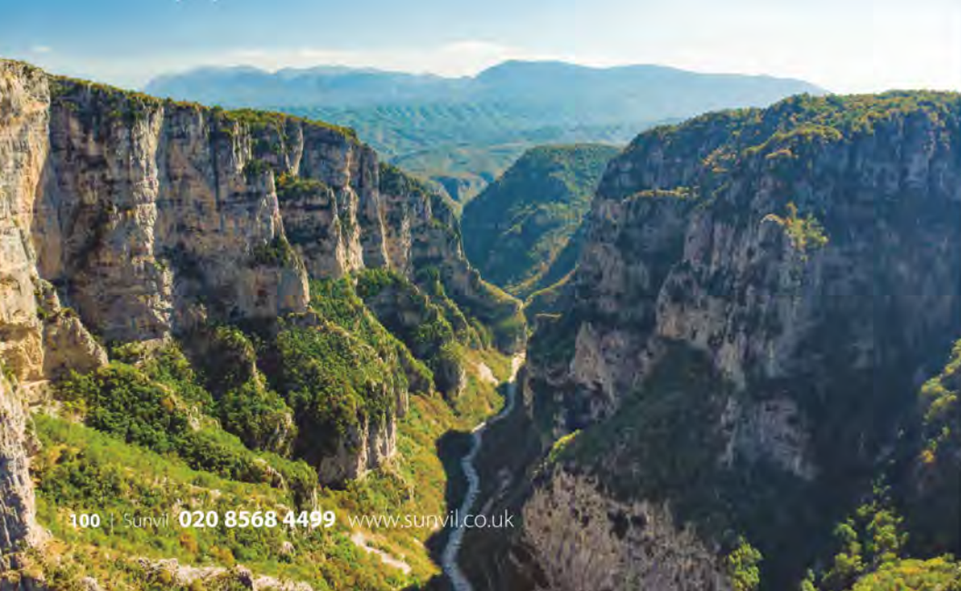
Vikos Gorge, Zagori

After breakfast, drive to Preveza Airport (1 hour 30) for your return flight to the UK.