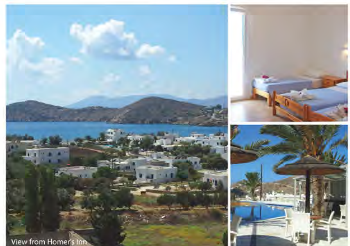
View from Homer's Inn