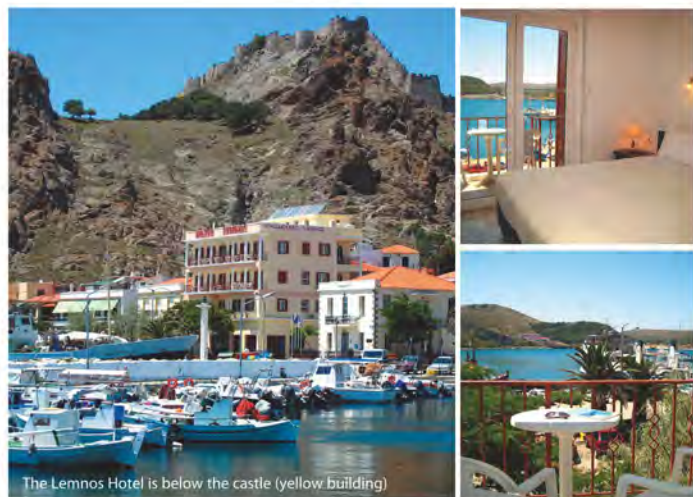
The Lemnos Hotel is below the castle (yellow building)