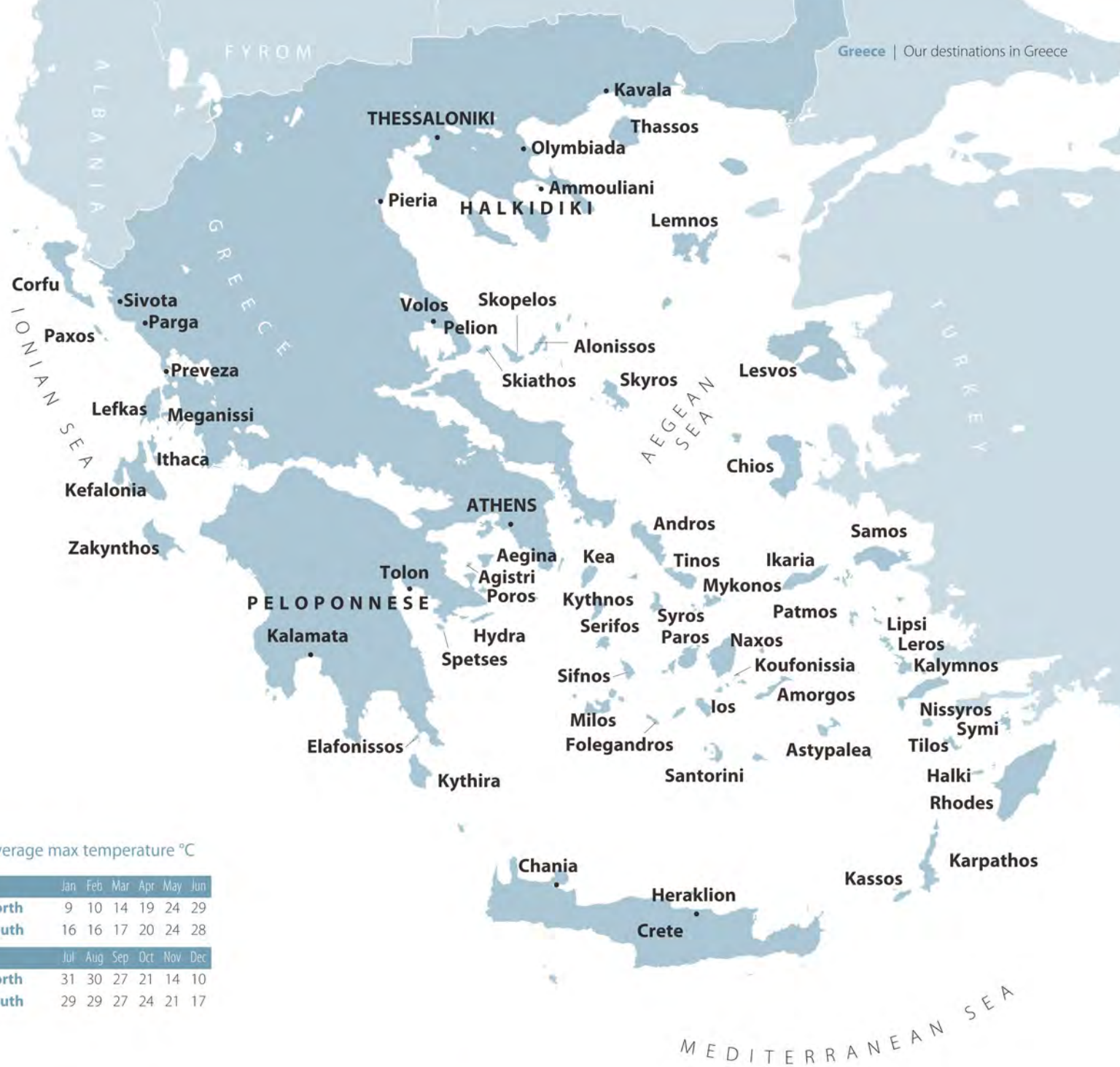
Average max temperature °C