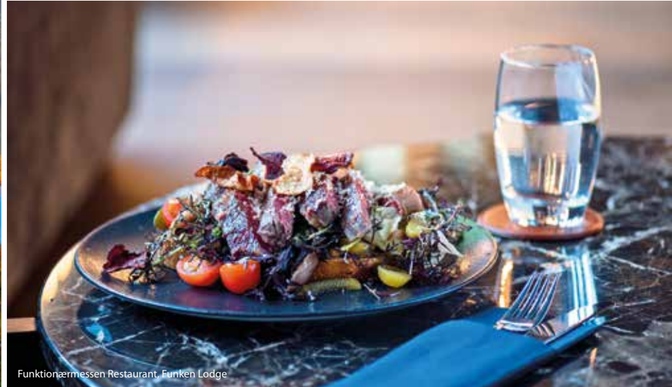
Funktionærernes Restaurant, Funken Lodge