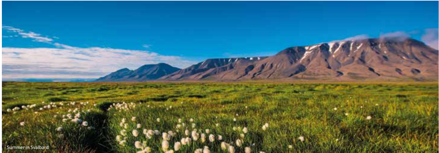
Summer in Svalbard

The untamed wild is all around Longyearbyen - the magnificence and scale of the scene is guaranteed to capture the heart of all explorers. Here you'll find glaciers groaning against a mirrored sea, jagged mountain peaks, vast icebergs and a barren ground where lichen and delicate tundra flowers grow.