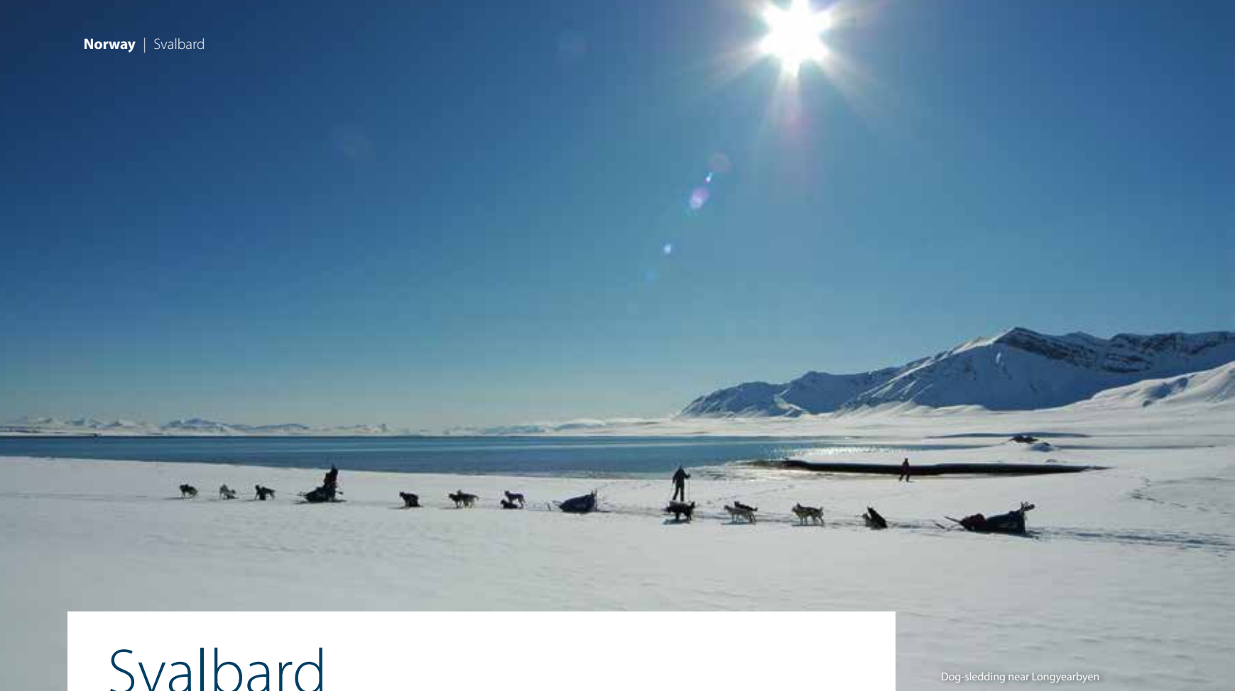
Dog-sledding near Longyearbyen