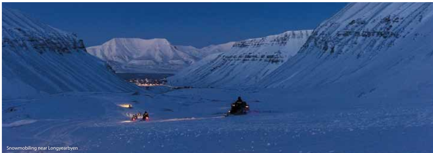
Snowmobiling near Longyearbyen

The focus point for visitors to Svalbard is Longyearbyen, a community of 2000 inhabitants on the shores of the Isfjord. It is the northernmost year-round settlement in the world and is the departure point for day excursions, expeditions and cruises, as well as a fascinating destination in its own right.