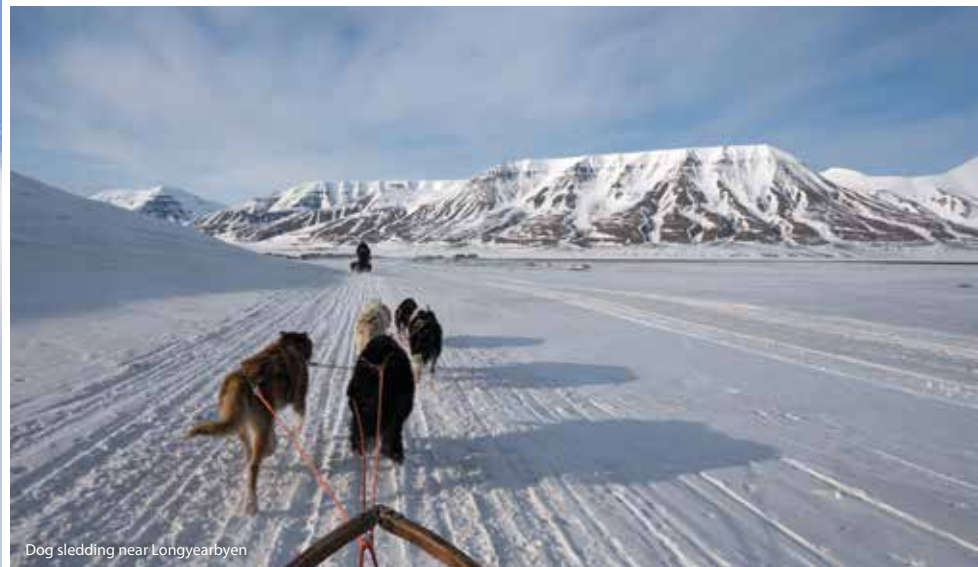
Dog sledding near Longyearbyen