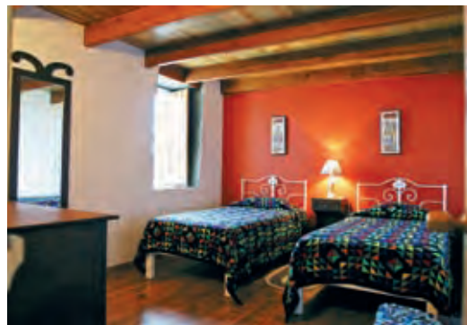
Casa da Vinha