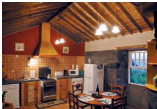
Casa da Vinha