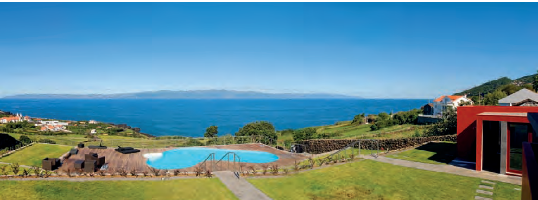
Casa do Ouvidor pool