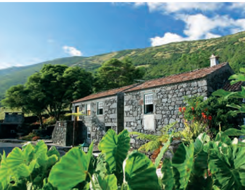
Casa da Vinha