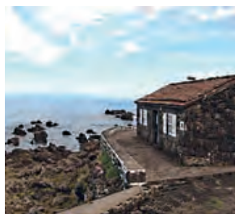
Casa do Garajau

Relax and enjoy the dramatic ocean and countryside views; participate in a whale and dolphin watching excursion; join the locals and swim/sunbathe at the natural rock pools; explore the volcanic, vineyard landscape of Pico – declared a UNESCO World Heritage Site; climb Mount Pico (with a guide) or take a day trip to Sao Jorge or Faial – the choice is yours.