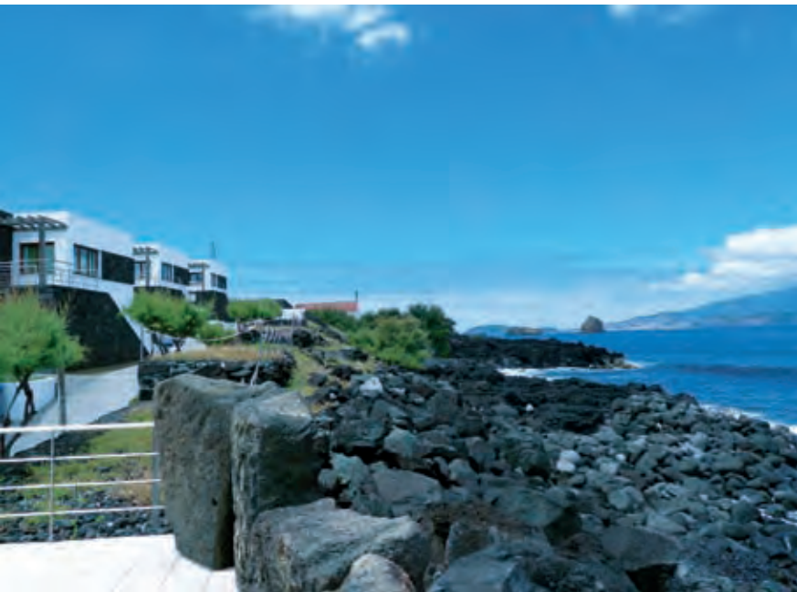
Baia da Barca, Madalena