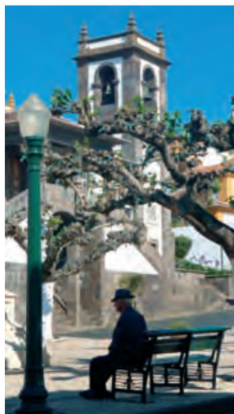
Angra do Heroísmo

Praia da Vitoria, to the east, with its sandy beach is a charming small town and, inland, the views from the 500m high point of the Serra do Cume, over the gigantic quilt made up of green pastures separated by black volcanic stone walls, quite breathtaking.