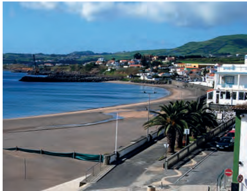
Praia da Vitoria

Buffet breakfast ■ Panoramic restaurant with ocean view serving Portuguese and International cuisine (à la carte) ■ Bar with ocean view serving snacks ■ Several lounges ■ Complimentary WIFI internet connection in the public areas ■ First floor bar and terrace with ocean and garden views ■ Occasional musical recitals on Saturday nights ■ Shop selling local handicrafts, clothing and souvenirs ■ Outdoor salt water swimming pool in the shape of a semi-circle (12 x 20m) open all year ■ Pool bar in summer ■ 2 Lifts ■ Wellness centre with indoor heated swimming pool (6 x 9m) – swimming cap required, fully equipped gym (with instructor), one squash court (payable locally), Jacuzzi, sauna and Turkish bath (free of charge) & Thalgo beauty centre offering various marine treatments and a physical therapy room ■ Public tennis court within 800 metres ■ Free parking ■ PADI 5-star dive centre (bookable locally).