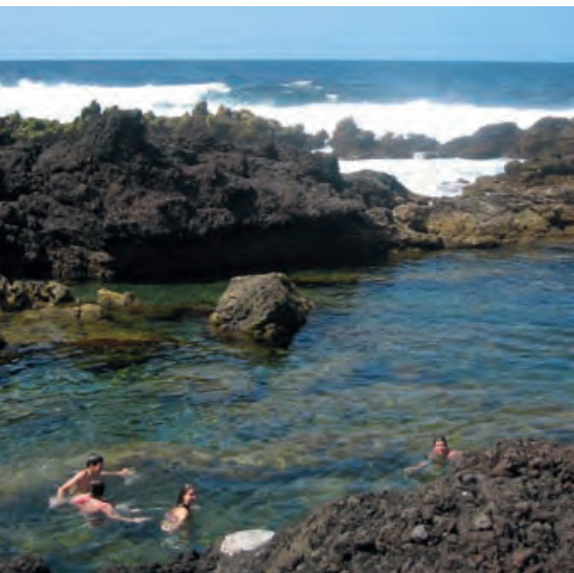
Natural rock pool