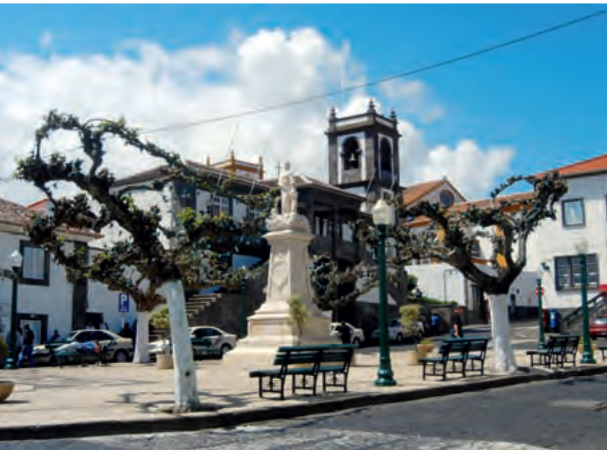
Angra do Heroísmo