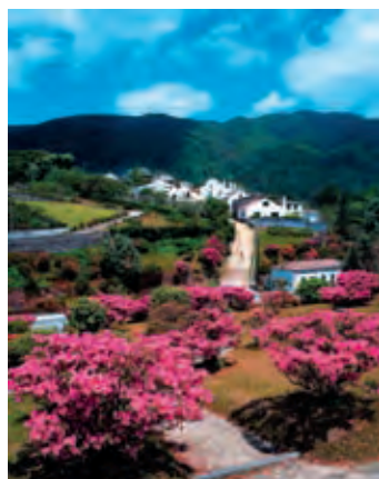
Furnas, Sao Miguel

Depart from Ponta Delgada to Sete Cidades lakes by the mountain road. Stop at the 'Vista do Rei' belvedere which, on a