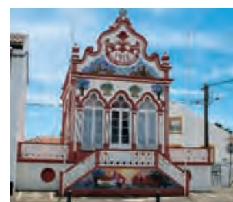
Holy Ghost Chapel, Terceira