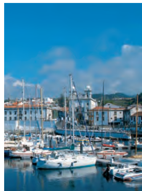
Angra do Heroismo, Terceira