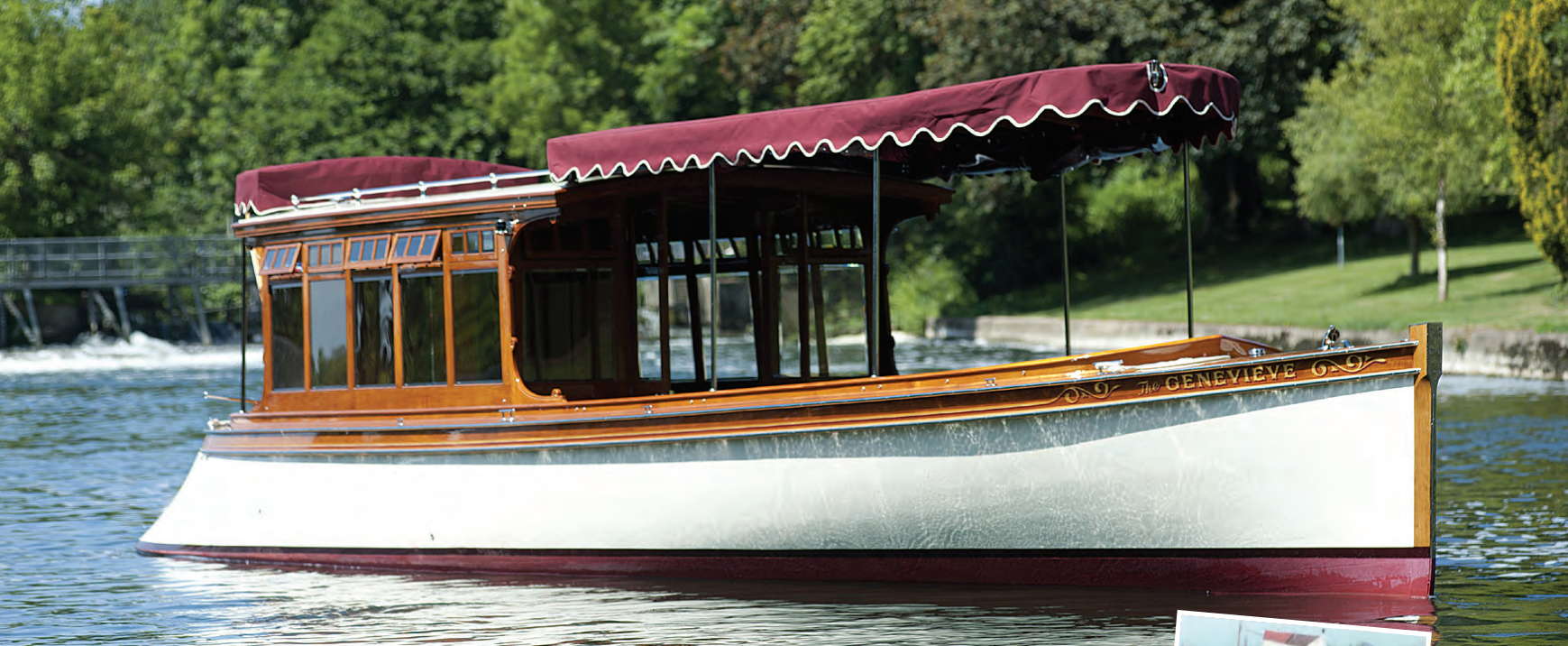
The Genevieve as it was