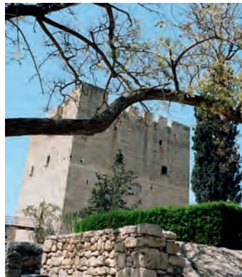
Kolossi Castle – Photograph Doros Partasides

The large tourist area encompasses restaurants of all kinds, nightclubs, pubs and bars and watersports from the beaches. A few kilometres from Limassol is the Watermania Water Park with a 3,000 sq. m. wave pool, Kamikaze ride, waterslides and lazy river. The town has a great number of shops including those specialising in jewellery and leather goods. Annual events include a wine festival in September and a carnival in March. Limassol is also the port from which ships set off for trips to The Holy Land and Egypt.