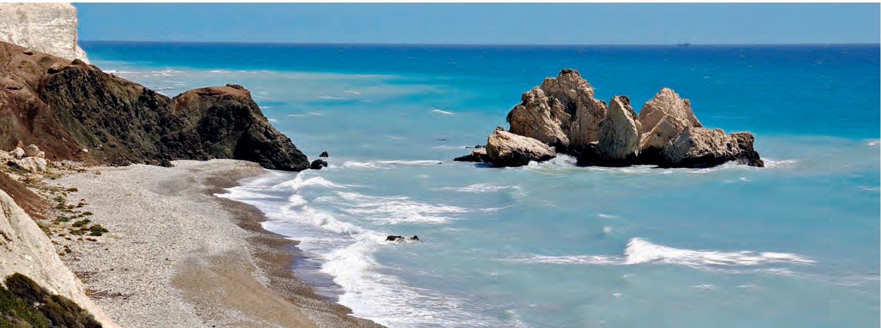
Aphrodite's Rock area