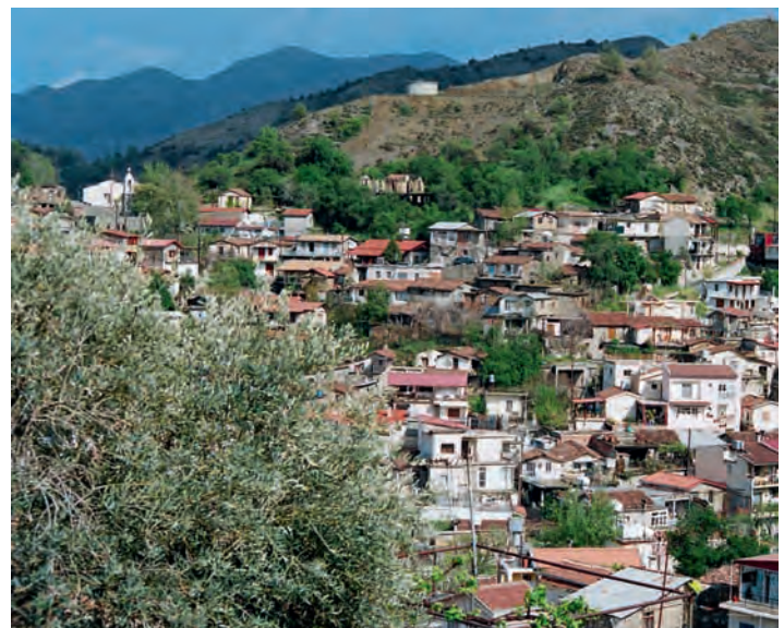
Palechori village – Doros Partasides