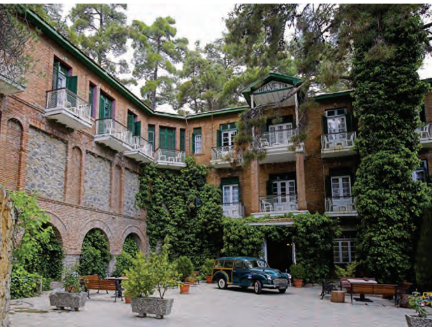
New Helvetia Hotel