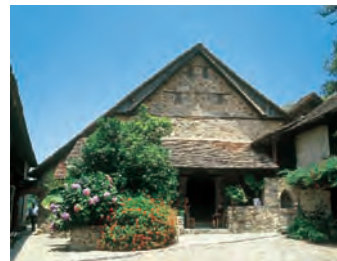
Church of Aghios Ioannis Lampadistis – Kalopanagiotis Village

These are perfect bases from which to visit picturesque mountain monasteries or painted Byzantine churches, for countless scenic drives through pretty villages and for many memorable walks and picnics in the beautiful countryside.