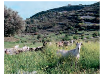
Photograph Doros Partasides