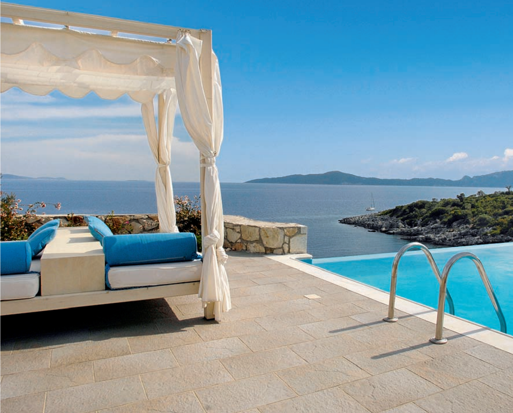
One of the Limonari Villas

For more detailed information & photos visit www.gicthevillacollection.com