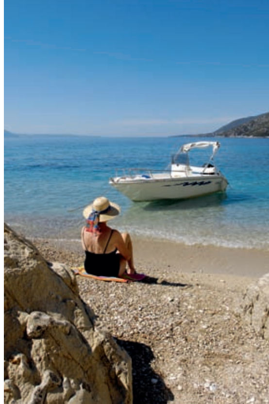
A north coast beach