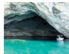
A Meganissi sea cave

A coastal road winds through a beautiful landscape of olive groves and pine trees, where the remains of ancient windmills and threshing floors can be found, and leads to secluded bays and beaches.