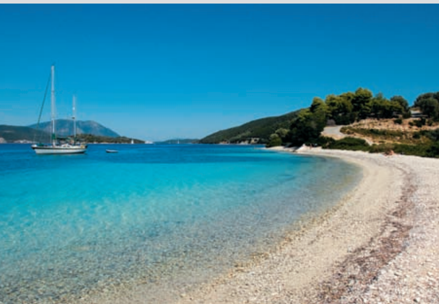
Agios Ioannis beach

Spartochori enjoys dramatic views across the sea to the mountains of the Greek mainland and has two minimarkets.