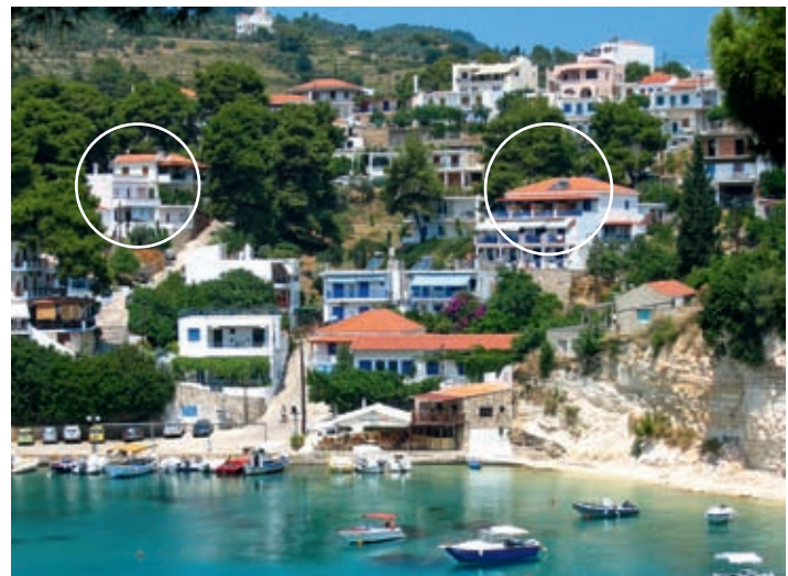
Location of Maria Studios (right hand side). Pefkas Apartments are circled to the left.

On the floors below are eight twin-bedded hotel rooms. These rooms are equally nicely done, and have the same facilities without the cooker. Although the rooms do possess a kettle and fridge, breakfast is included in the price. Sea views are also to be had from the front terrace. Good accommodation in an excellent location – early booking recommended.