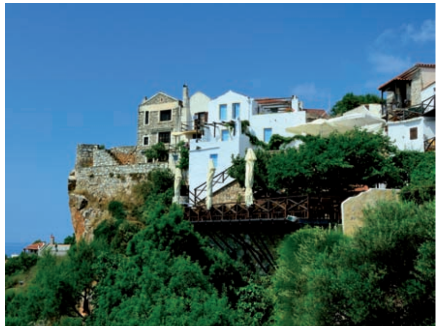
Alonissos Old Village