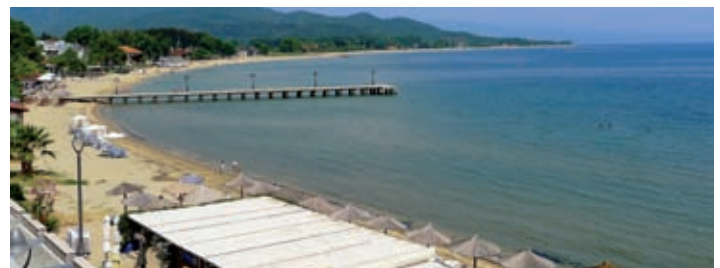
View from Akroyiali

The Akroyiali, although simple, is a near-perfect base for a completely untrammelled holiday where everything you actually come on holiday for is right on your doorstep.