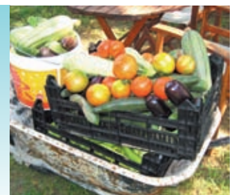
Organic veg from their own garden!

desserts (including fruit). Unusually, good vegetarian options and even some sea food and fish dishes are included (the area is known for its fresh mussels!) – only the more expensive of these items carry a surcharge. Although typically 'no frills' taverna fare, we believe the holiday prices here to be good value. If you have any dietary requirements please advise us at the time of booking.