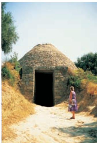
Nestor's Tomb, near Pylos

A fly-drive holiday on the mainland offers the opportunity to discover some of the most beautiful areas of Greece. The richness of the history, scenery and interest here is vast. A fly-drive allows you to explore areas rarely featured in holiday brochures, and will well reward the more independent traveller in search of more adventure than the normal holiday provides.