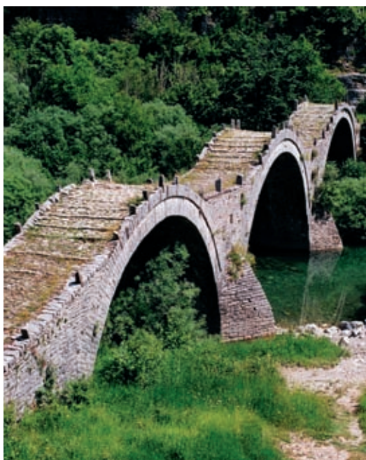
Triple Bridge, Kipi, Zagori