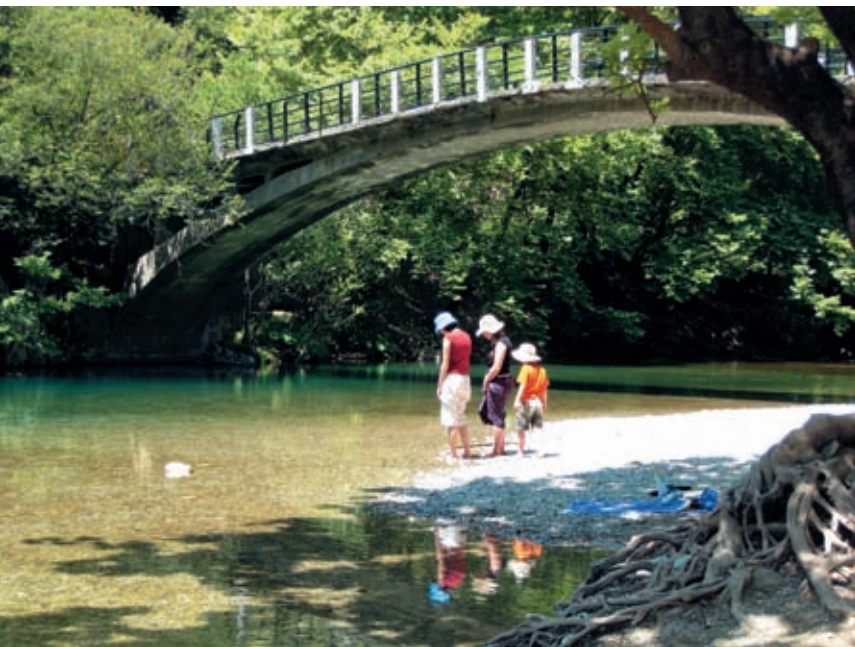
Zagori National Park