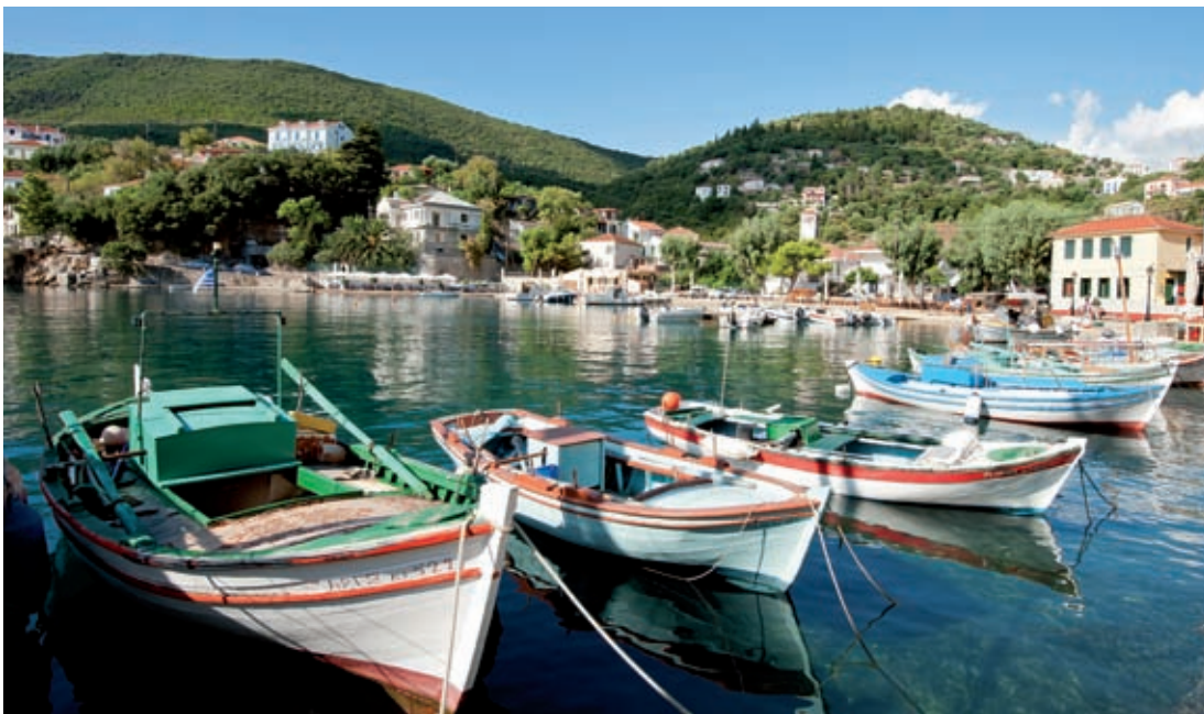
Kyparissa location above the harbour (top left)