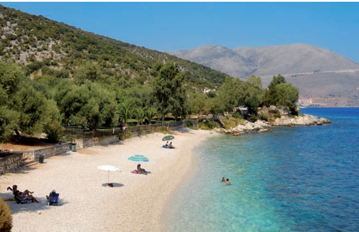
Near Agia Efimia