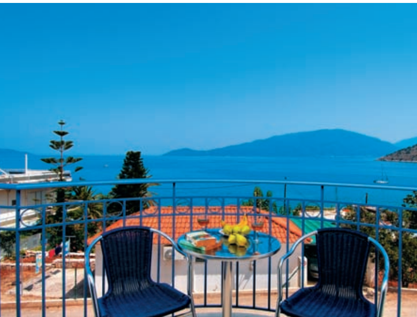
Olive Bay Studios