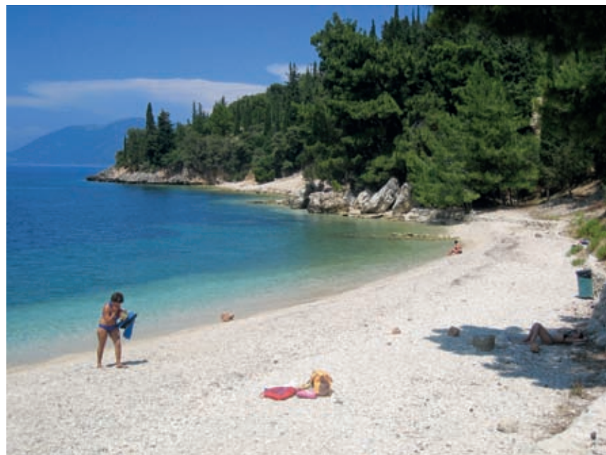
Beach near Sami