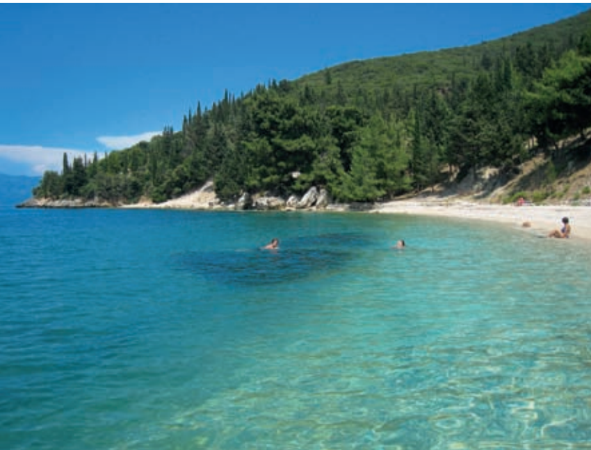
Beach near Sami