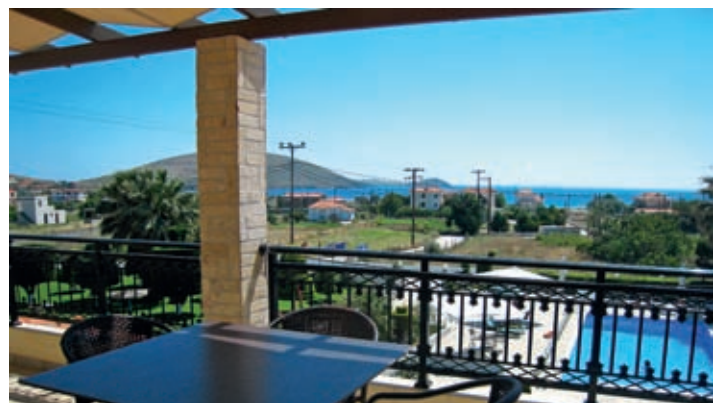
Top floor balcony (Suite)