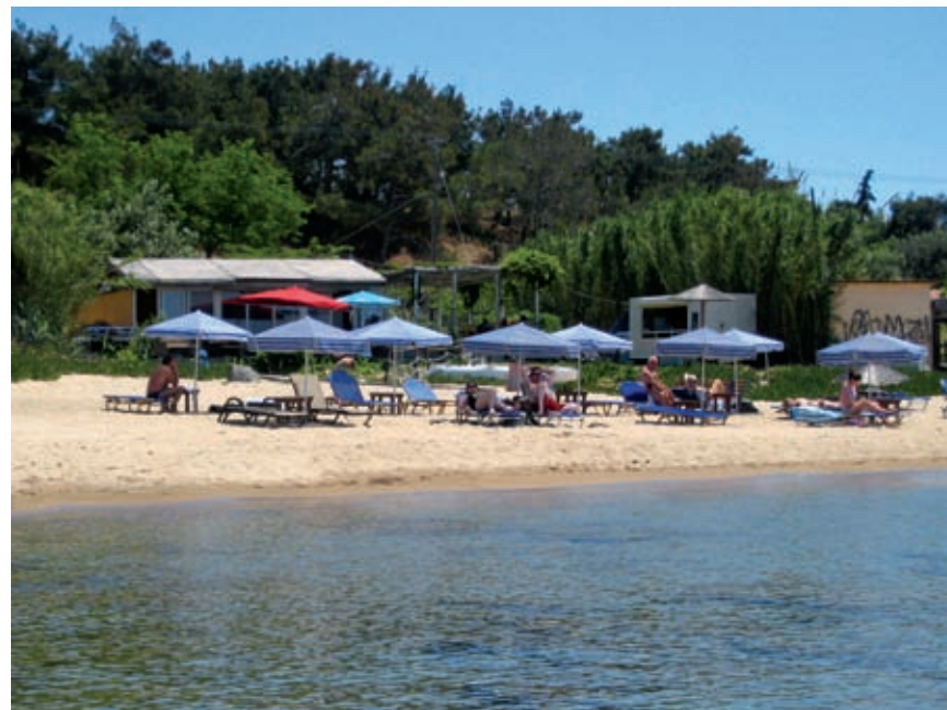
Riha Nera Beach