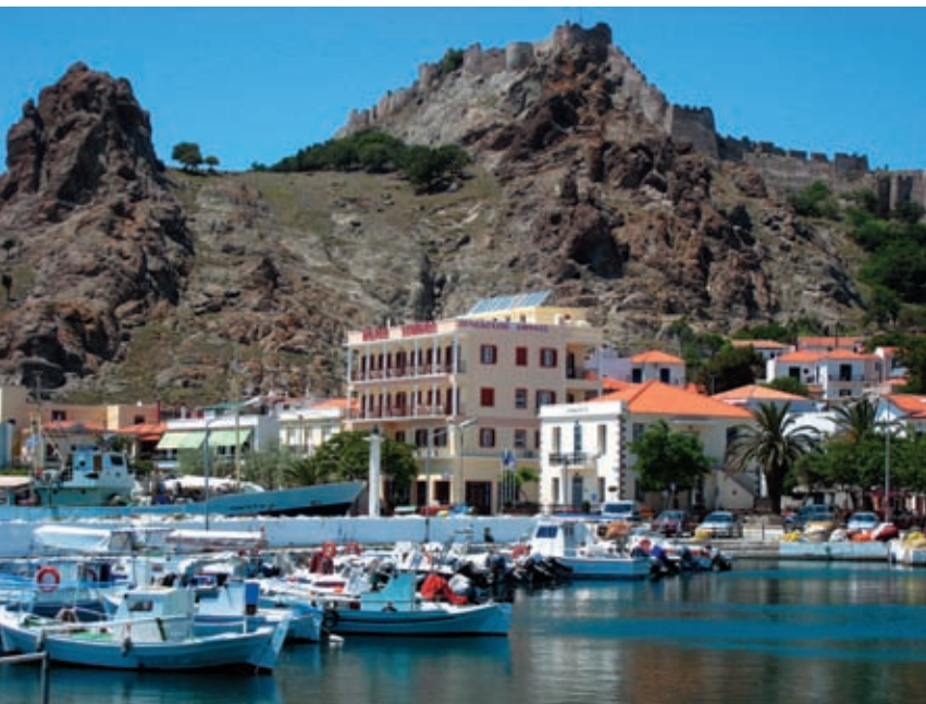
The Lemnos Hotel is below the castle (yellow building)