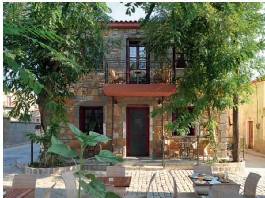
Varos Village reception and breakfast area