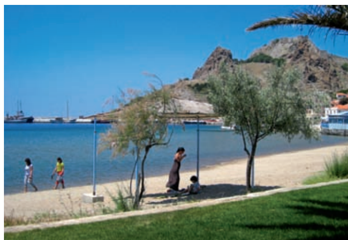
Myrina Town Beach