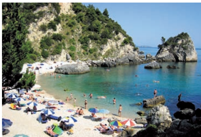
Piso Krioneri Beach

In the garden is a good-sized freshwater swimming pool with a low-key pool bar to one side – snacks are also available here. From the hotel it is only a minute's flat walk to pretty Piso Krioneri beach, three minutes to Parga's main town beach, and five minutes to the harbour itself.