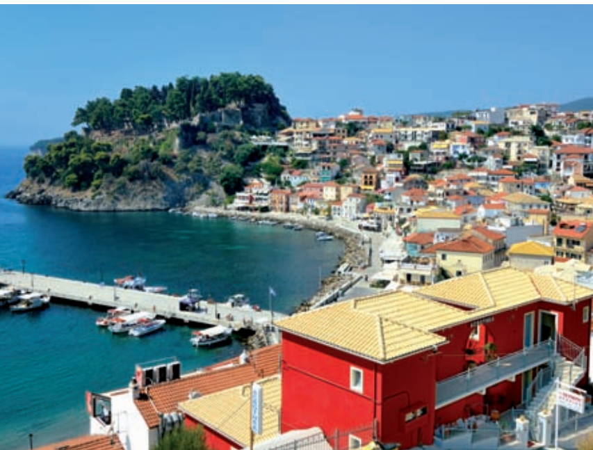
Acrothea is the red buildings