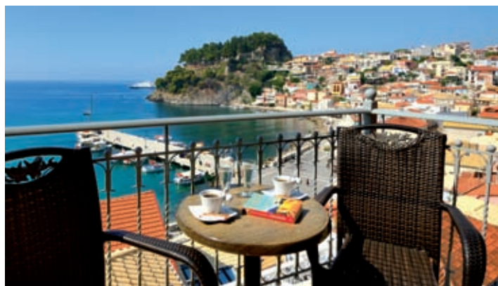
View from top floor

A minute's walk via one of Parga's warren of tiny alleys brings you to the harbour, and a further minute or two to popular Krioneri beach. However, the slightly elevated position of the hotel, and a number of steps at the property, would make it unsuited to those with walking difficulties.