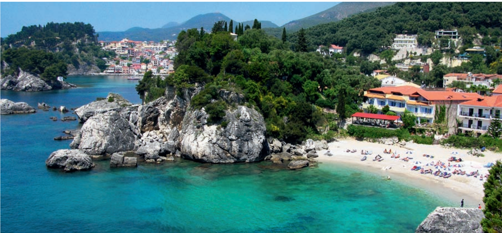
Parga and beachfront location of Achilleas Hotel (left hand side)