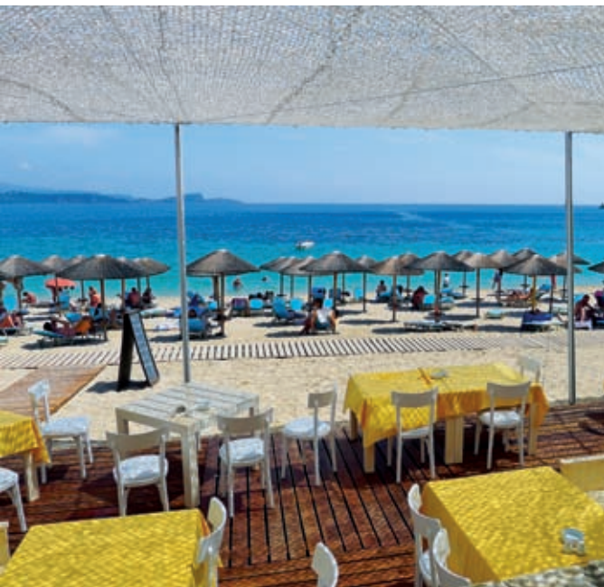
Lichnos Beach Hotel beach restaurant