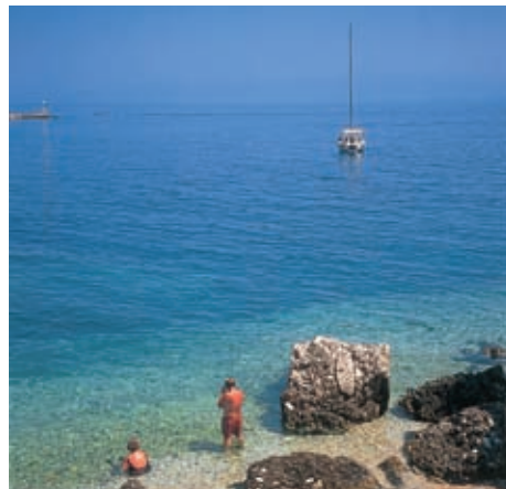
Cove by Mermaid Cottage

Air-conditioning: Available at a local charge of 5 euros per day