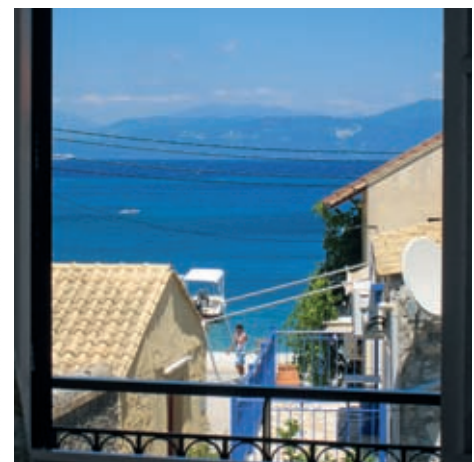
View from Stamatis bedroom