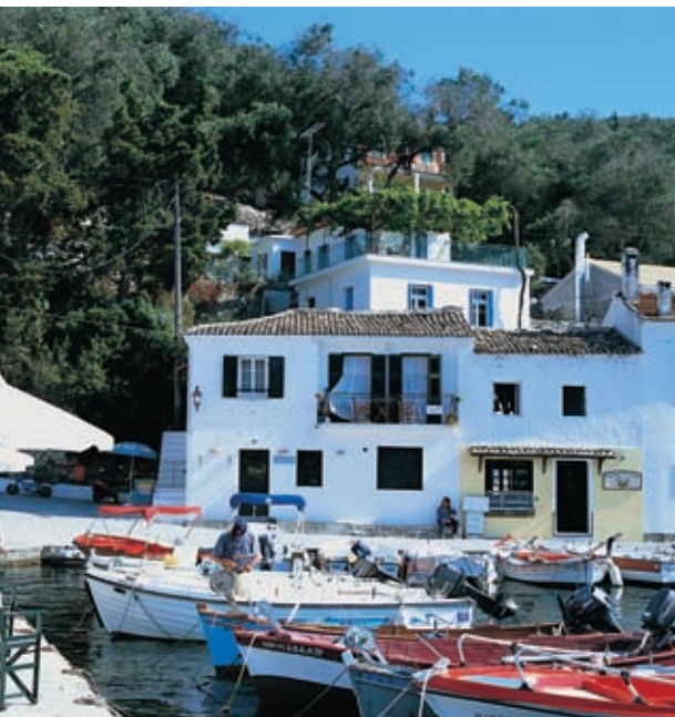
Aleca's in the foreground (open balcony shutters). Sophia's is above and behind (with vine)