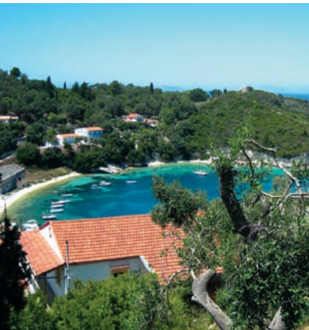
View from Ioanna