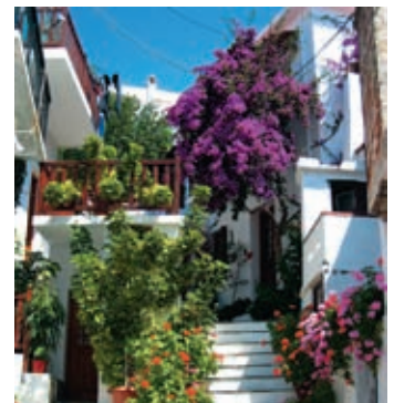
Villa Kamara (right hand side)