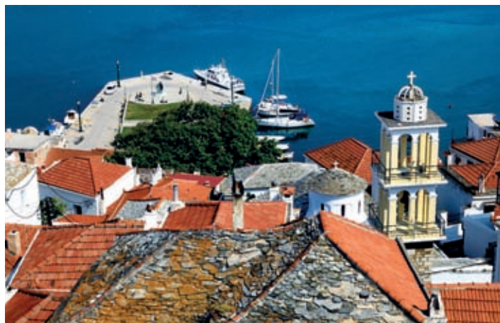
View from Kyrene

A 5 minute walk down through the stepped pretty streets brings you to the harbour. However, this upper part of town has a mini-market within a 3 minute walk, and a taverna within the old castle walls. Glifoneri beach is an approx. 20 minute walk.