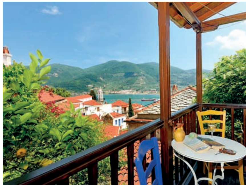
View from Kyria Florence