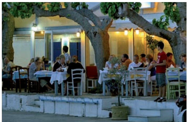
Skopelos Town restaurant