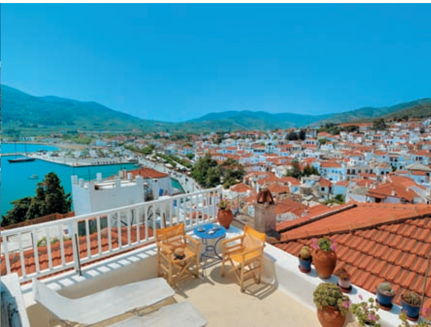
View from Nefeli