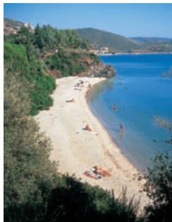
Lagoudi Beach, Afissos