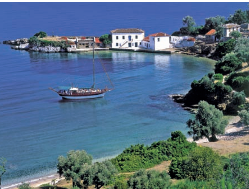
Zasteni, western Pelion