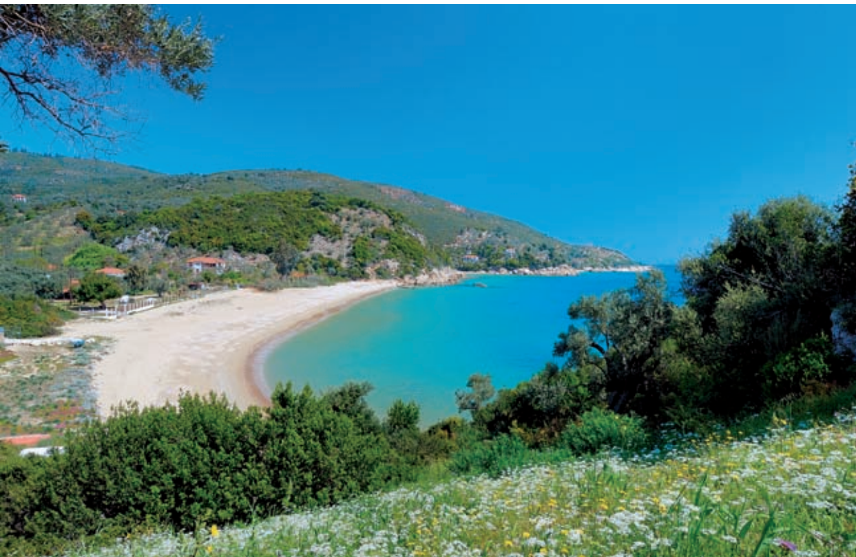
Kastri Beach, Southeast Pelion