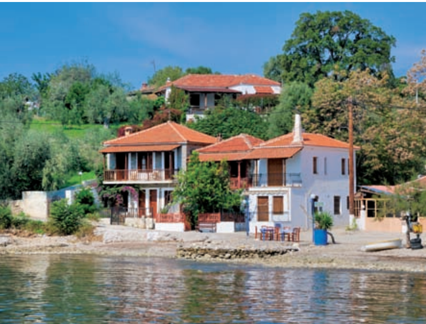
Lefokastro Apartments are the left-hand building