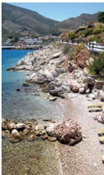
Beach below Ilidi Rock

Modern in style (opened fully in 2009), the hotel comprises several buildings. The studios contain twin or double beds, a kitchen area with 2-ring mini-oven and fridge, air conditioning, tiled shower room, sat tv, hairdryer and front balcony with wonderful views over the bay. The apartments have the addition of a living room with two sofa beds (some built in) for children and a bigger terrace. The