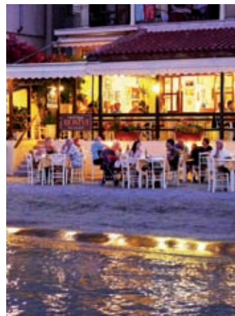
Romvi at fresco dining