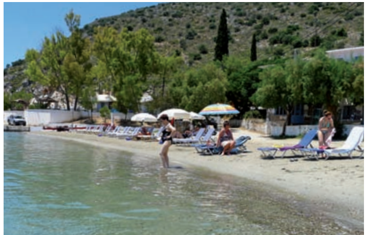
Beach by Hotel Minoa

The Minoa offers not only an excellent location, perhaps the best in the village, but a standard of comfort and facilities above its official category and in our opinion is one of the most well-run and comfortable hotels in Tolon.