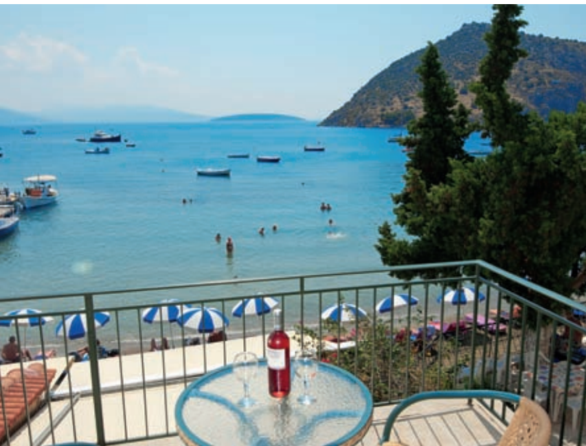
View from Hotel Romvi front rooms