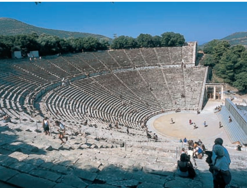
Ancient Epidavros Theatre