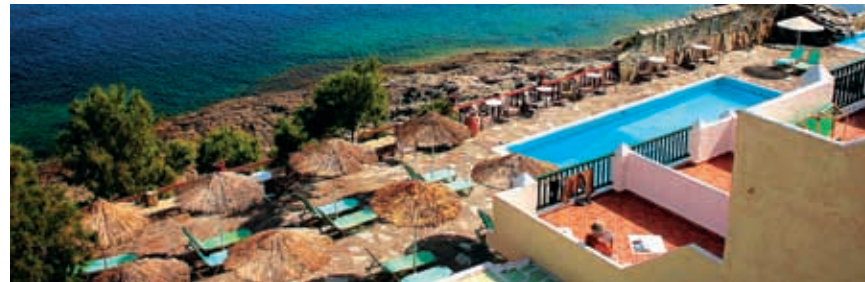
Cavos Bay Hotel