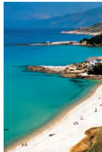
Livadi Beach and location of Valeta Studios (right)

Each pair of studios shares a common entrance hallway with an outside door and can therefore be combined for parties of up to five (one ground floor, one first floor).