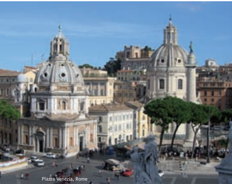
Piazza Venezia, Rome