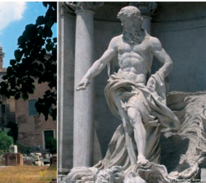
Trevi Fountain, Rome