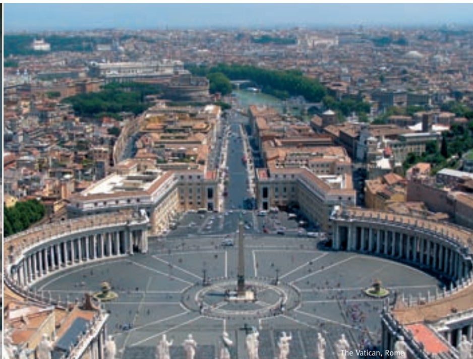
The Vatican, Rome