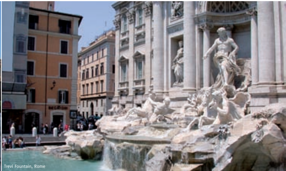
Trevi Fountain, Rome