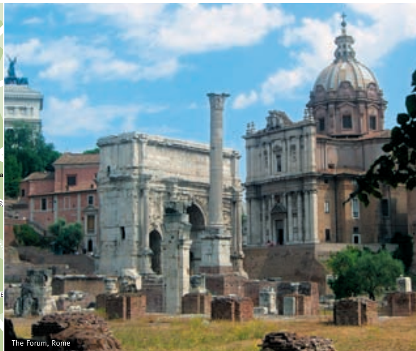
The Forum, Rome