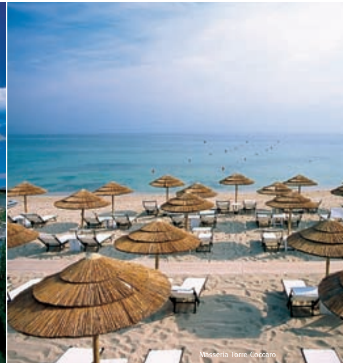
Masseria Torre Coccaro