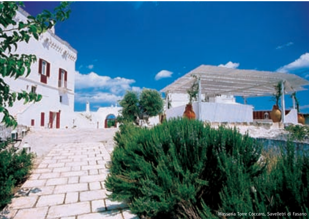
Masseria Torre Coccaro, Savelletri di Fasano