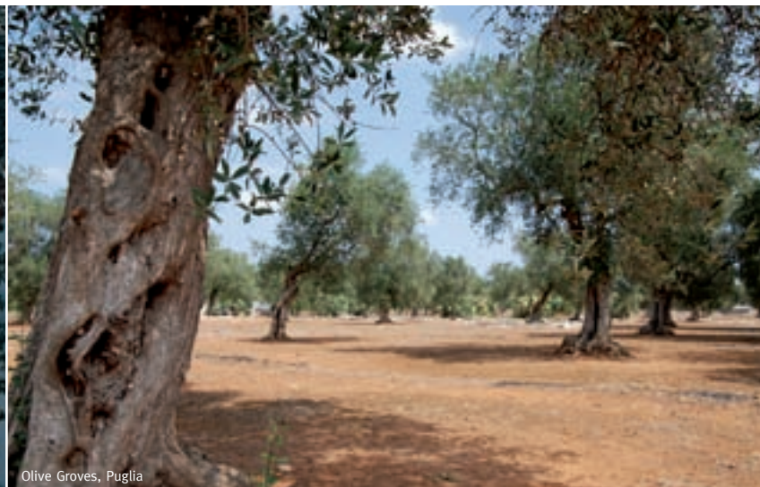
Olive Groves, Puglia