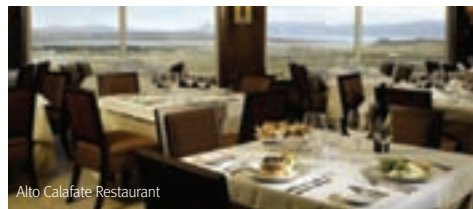
Alto Calafate Restaurant

The whole region is one enormous glacial valley controlled by the sheep farming Estancias which can be visited while staying in Calafate. Here, the crested caracara and the condor are regularly sighted, soaring above the peaks and Patagonian plain.