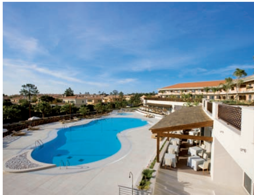
Monte da Quinta Suites