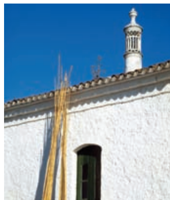
Traditional House, Algarve

Located 6km from Capo de Sao Vicente , the most southwestern point of continental Europe, Sagres is famed for its maritime past and for its links with Prince Henry the Navigator.