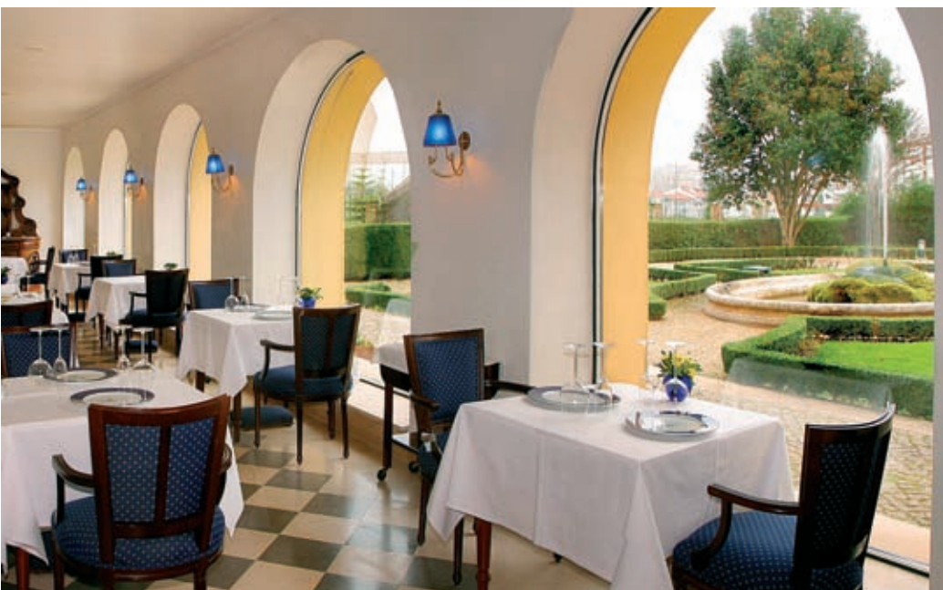
'Arcadas da Capela' gourmet restaurant