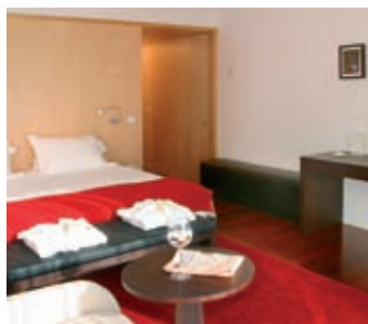
Bedroom, Spa wing