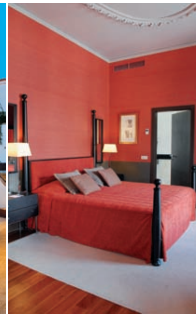
Superior room – Palace wing