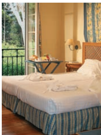
Bedroom, Garden wing

This fascinating property, set in 20 acres of botanical gardens (including two trees planted by Wellington himself) is steeped in history and tradition. The original building dates from the 18th century and has been in the current family for over 300 years. Although the property has been renovated, it has maintained many original features including high ceilings in the lavish public areas and fabulous frescoes. A hotel not to be missed!