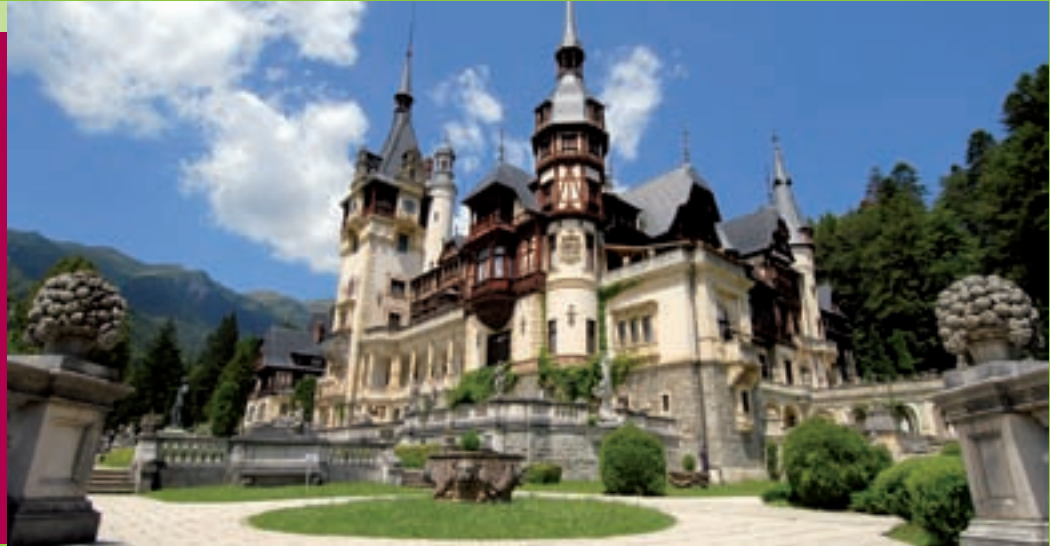
Peles Castle, Sinaia

Sunvil Discovery is organising an escorted, small group tour to Romania. This tour is ideal for first time visitors as well as for those who have already experienced the unique nature and natural beauty of the country. The tour, led by an experienced, English speaking guide, will provide an insight in to the people and culture of Romania and enable you to see and appreciate, at first hand, the very best of what the region has to offer.