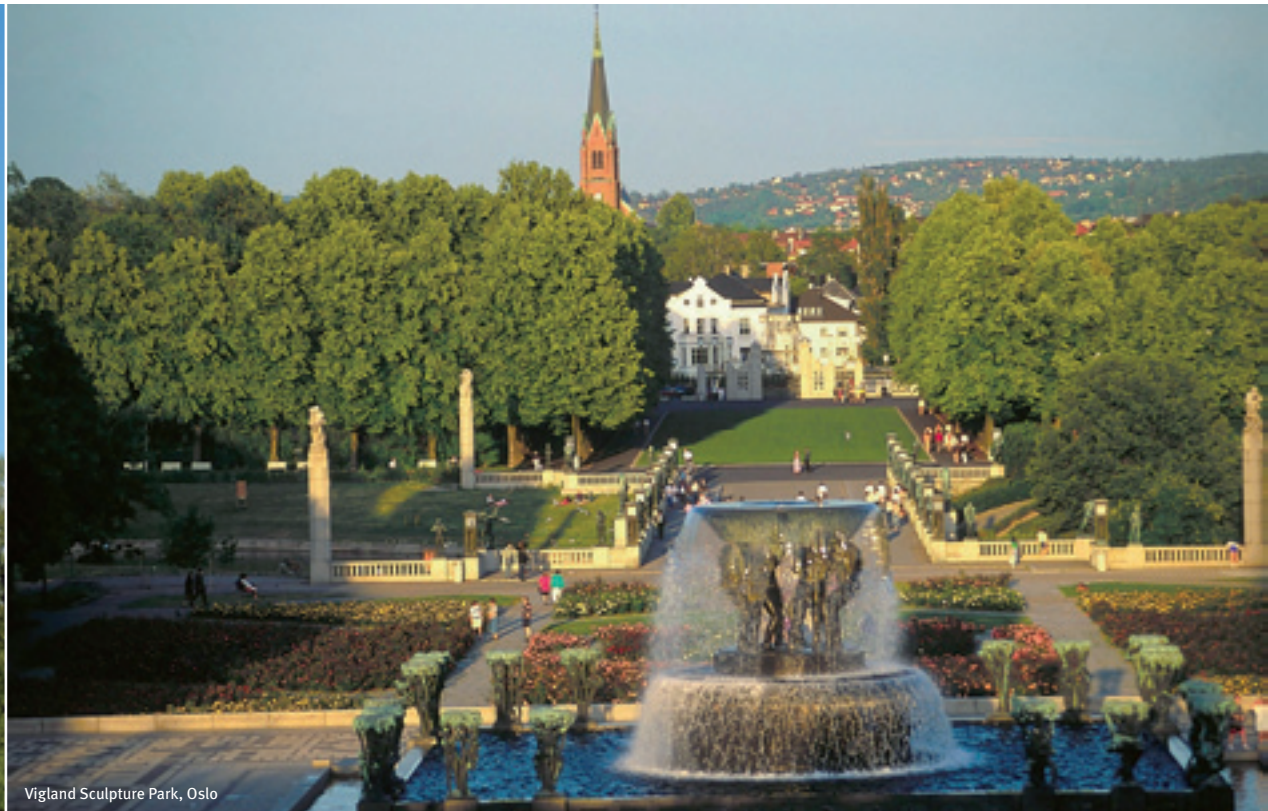
Vigeland Sculpture Park, Oslo