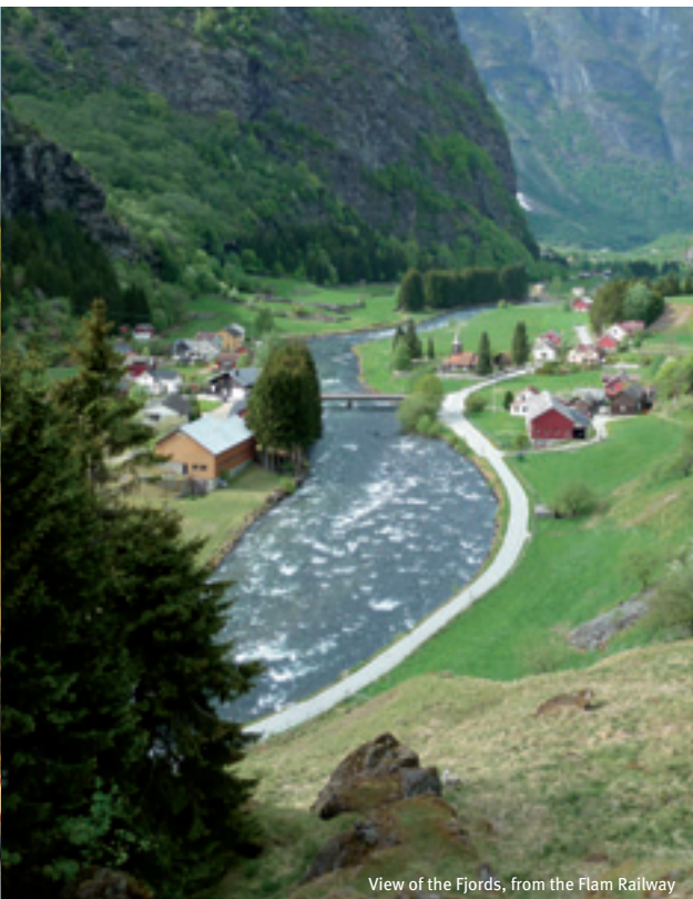
View of the Fjords, from the Flam Railway