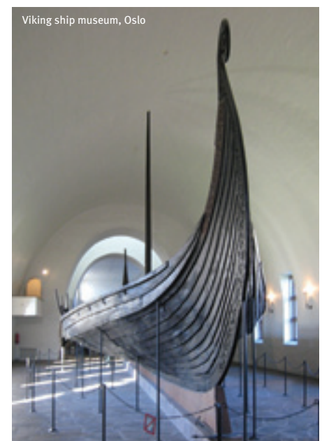
Viking ship museum, Oslo