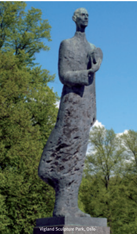
Vigeland Sculpture Park, Oslo