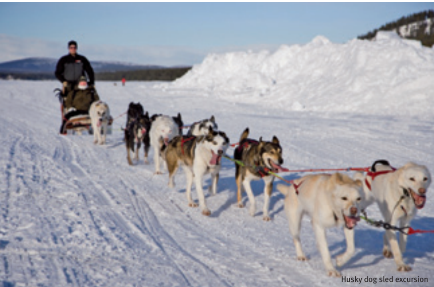
Husky dog sled excursion