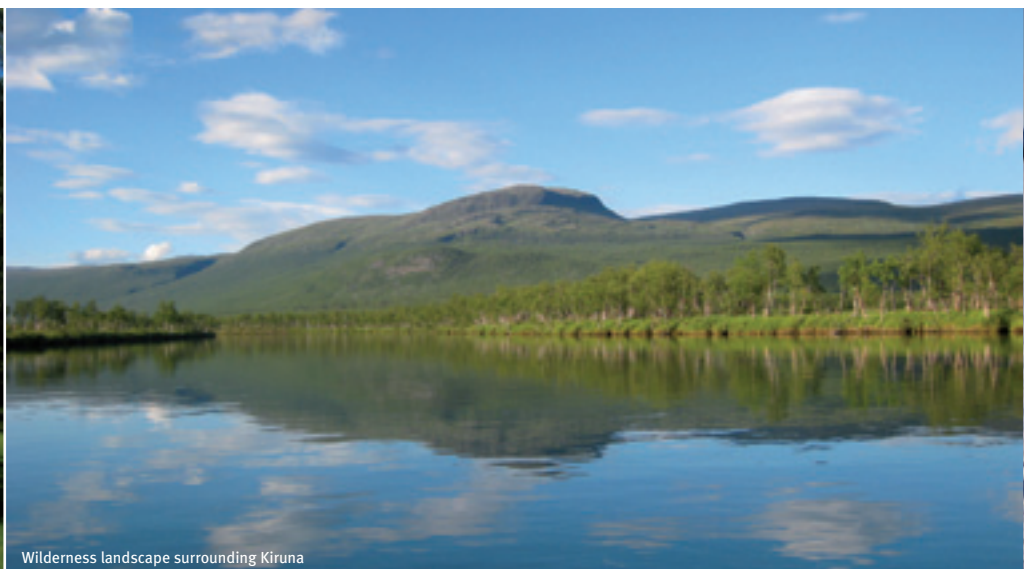
Wilderness landscape surrounding Kiruna