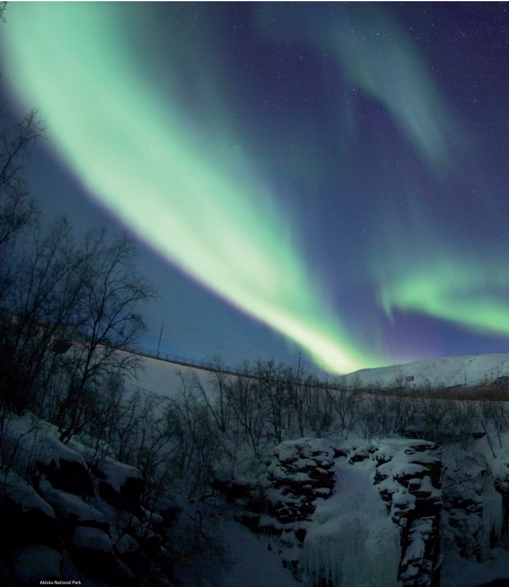
Abisko National Park