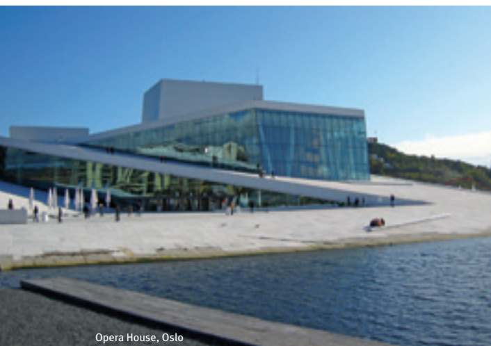
Opera House, Oslo