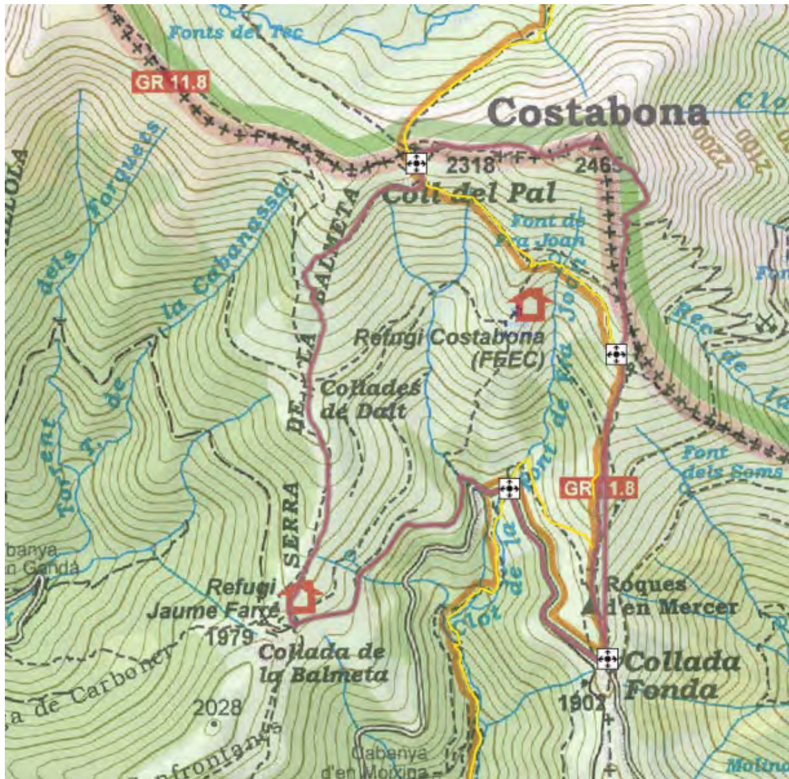
Línia rosa vell