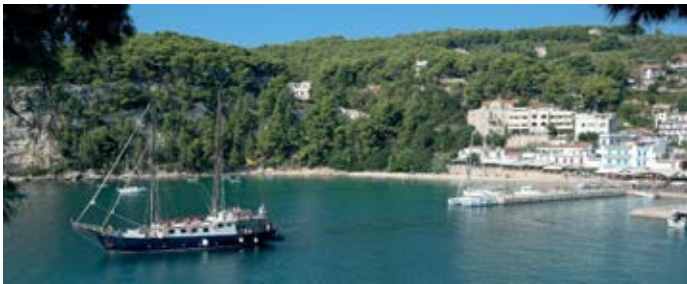
Patitiri view from near Nina's and Liadromia

The Studios: Self Catering Studios for 2/3 Air Conditioning Free WiFi