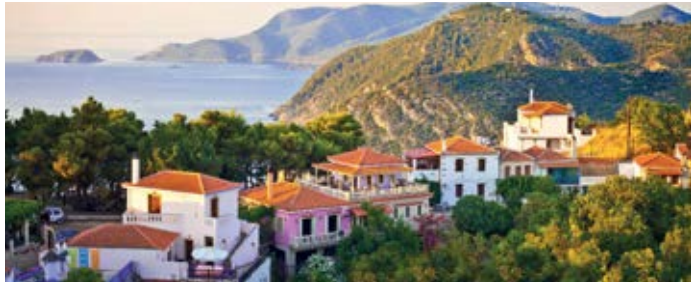
Alonissos Old Town