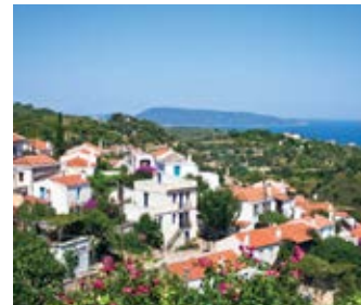
Alonissos Old Town

The Studios: Self Catering Studios for 2 Air Conditioning Free Wifi