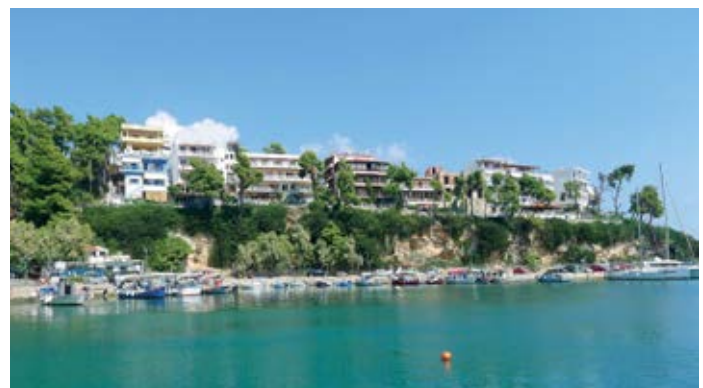
Liadromia (brown shutters centre) & Nina's (blue shutters centre left)

The Studios: Self Catering Studios for 2/3 Air Conditioning Free Wifi