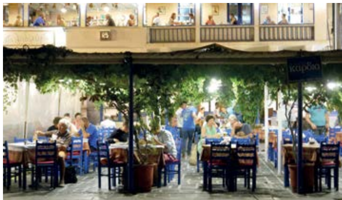
Naxos Town taverna