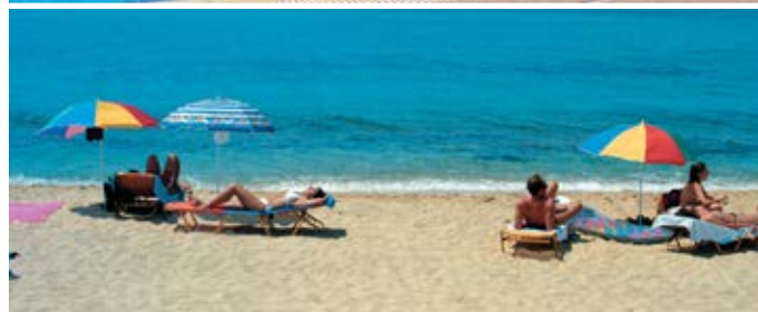
Beach at Plaza Beach Hotel