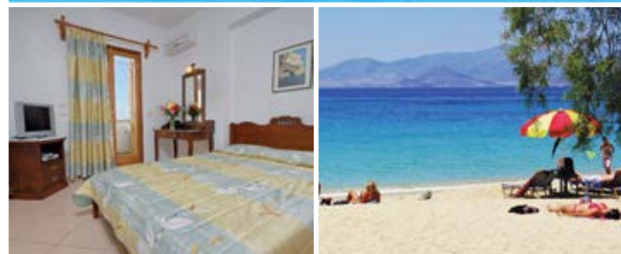
Aghios Prokopios beach