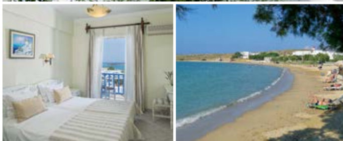
Agii Anargyri Beach