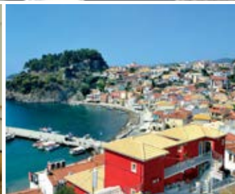
Acrothea is the red buildings