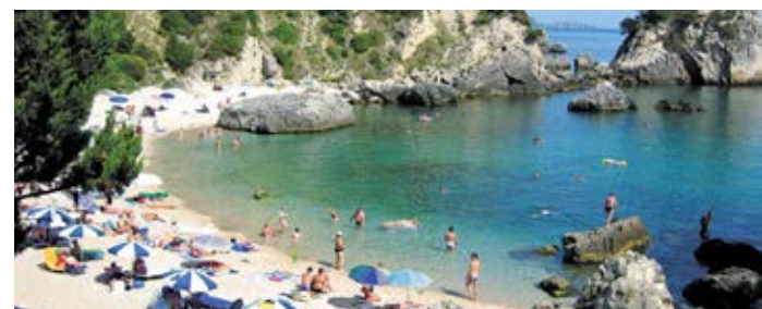
Piso Krioneri beach

The Hotel: 2 Stars Bed & Breakfast Air Conditioning Free WiFi