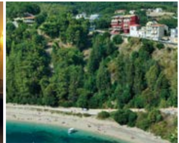
Palatino (red building) is directly above Valtos beach