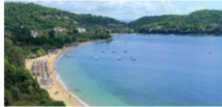
Aghia Paraskevi beach

Outside the hotel there are a number of local tavernas and the bus stop for town.