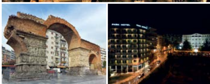
Arch of Galerius