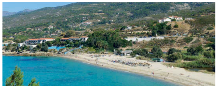
Livadi Beach and location of Valeta Studios (far end)

The Studios: Family Units for 4/5 Self Catering Studios for 2/3 Free WiFi