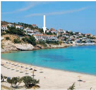
Erofli Hotel location (centre)

The Erofli is the highest category hotel on Icaria and occupies one of the best locations – just on the edge of Armenistis, directly above the sea, a three minute walk from the centre of the village in one direction and to the start of beautiful Livadi beach in the other. Built into the hillside on four floors (please note there is no lift) all 31 rooms possess fridge, satellite tv, hair-dryer, safety deposit box, tiled shower/wc, air conditioning (once the outdoor daytime temperature exceeds 30C) and a very spacious balcony (four have a garden patio) – those to the front have panoramic vistas over sea and coast. Furnishings are of good quality and décor tasteful.