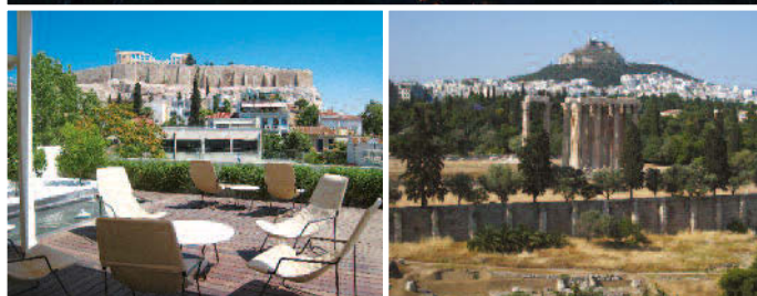
Herodion Hotel roof-terrace