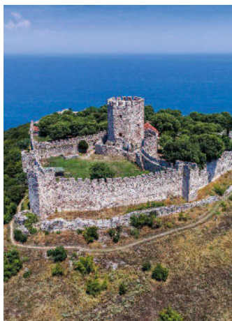
Castle of Platamon

The Olympus is the only 4 star hotel in Litochoro. Centrally located a 5 minute walk from the main square, it is a friendly and personal hotel, comfortable and not ostentatious. It is a very good base for those wanting to spend some time in Litochoro and exploring the mountain.