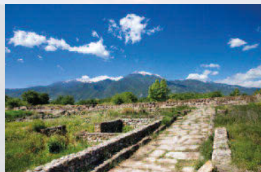
Dion archaeological site

One of the most important archaeological sites in Greece, is to be found at Dion, the city of Zeus and a centre of Macedonian culture. Other notable sites are the prehistoric settlement at Makrigialos, Byzantine Pydna (Kitros) and the fortified post-Byzantine settlement of Louloudies. All these sites are in close proximity, with Dion only 12 km (20 mins drive) from Litochoro.