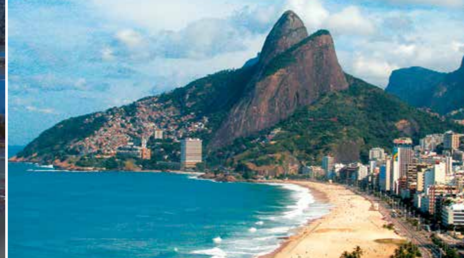
Rio de Janeiro