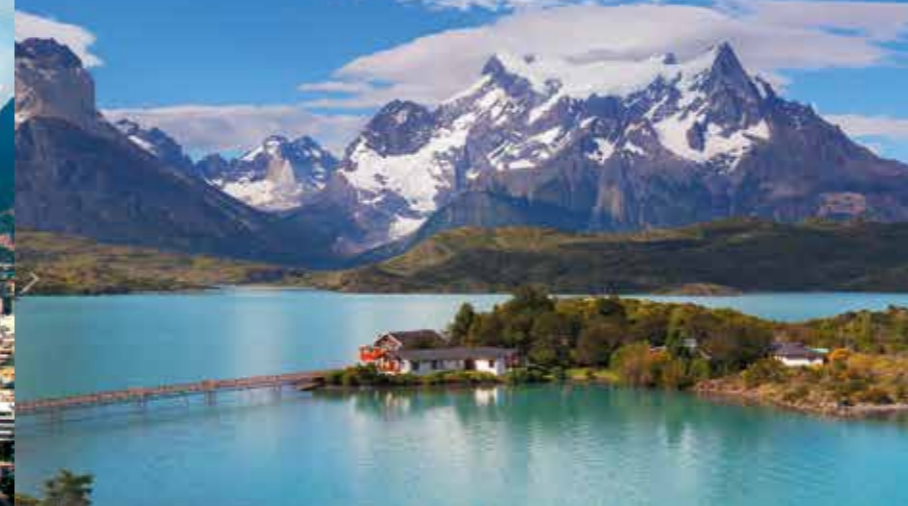
Torres del Paine National Park