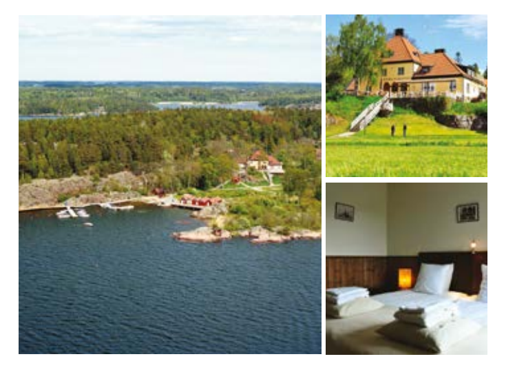
\ensuremath{^*} Guide prices based on 2-sharing a Standard room (7 nights) and flights from London to Stockholm Arlanda. Regional airports and single room supplements on request. Boat tickets payable locally. Please visit our website for further information on these and