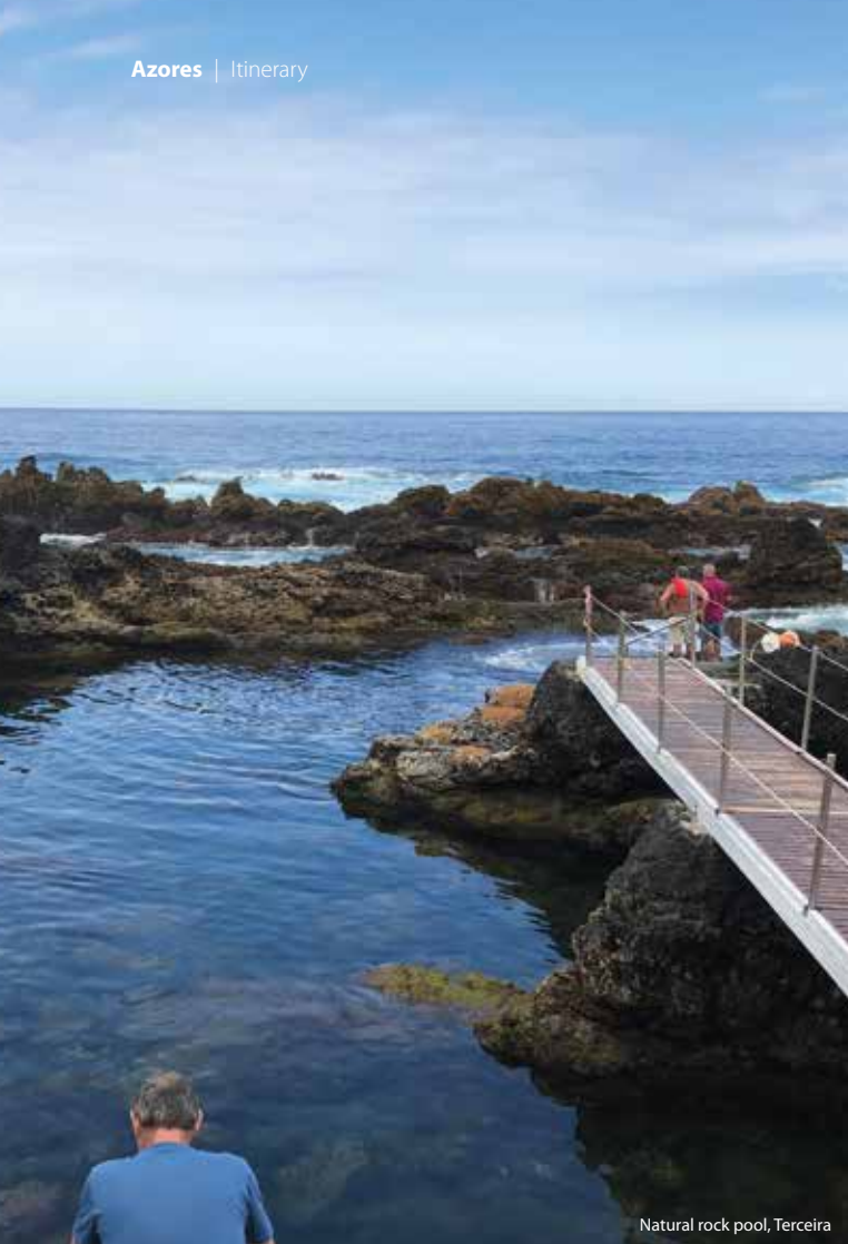
Natural rock pool, Terceira