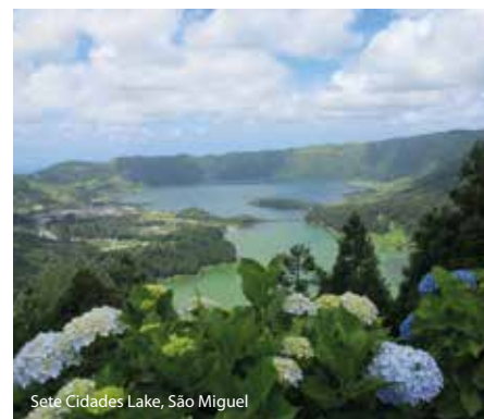
Sete Cidades Lake, São Miguel

Saturday: Transfer to the airport for your return flight home to the UK.