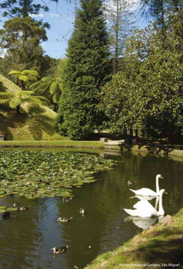
Furnas Botanical Gardens, São Miguel