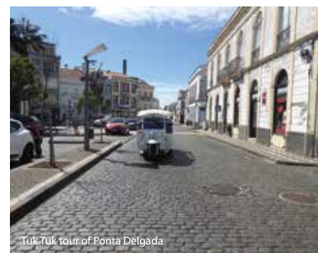
Tuk Tuk tour of Ponta Delgada

Day Eight: Transfer to Ponta Delgada airport for your return flight to the UK.