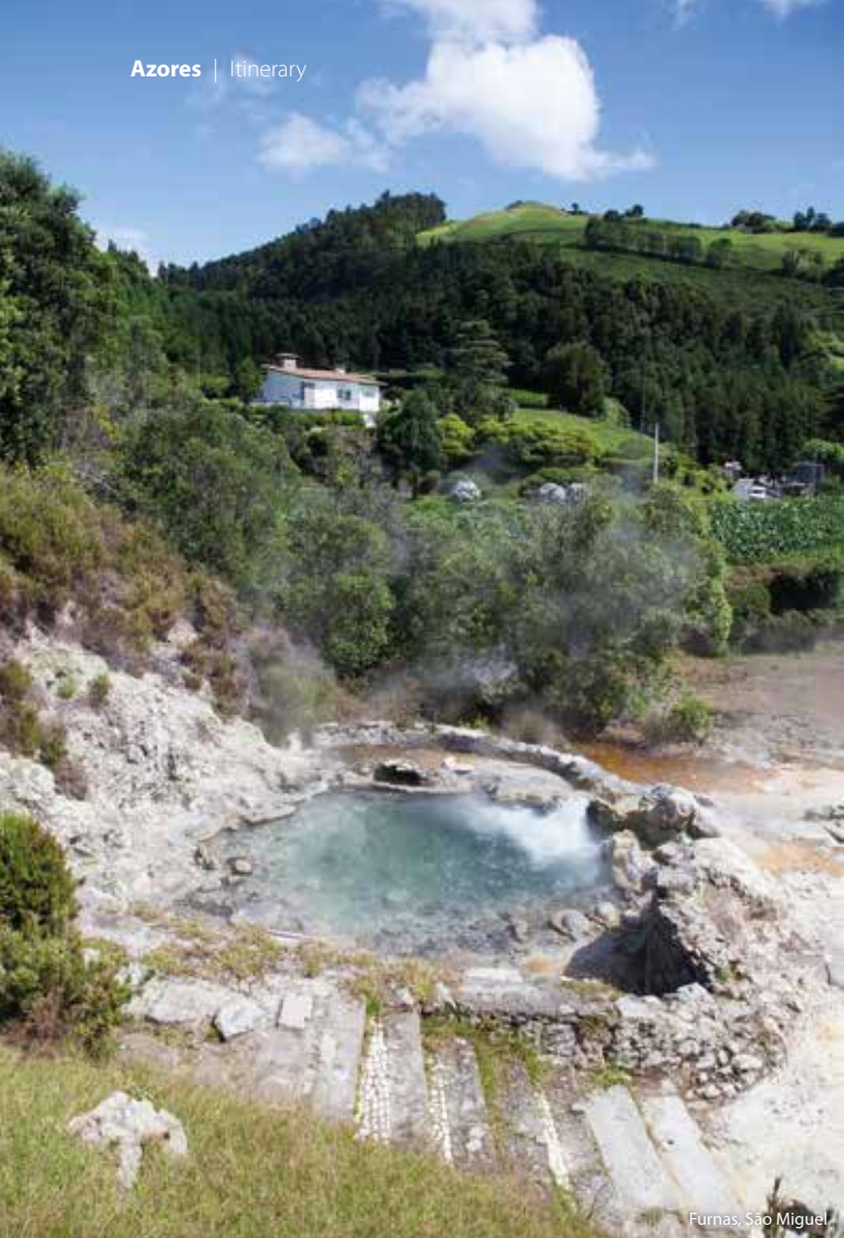
Furnas, São Miguel