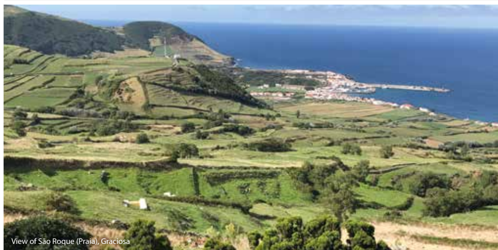
View of São Roque (Praia), Graciosa