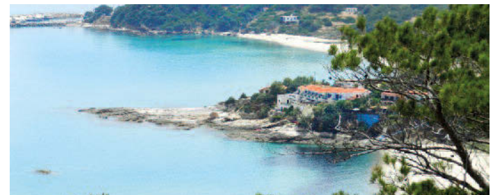
Livadi Beach and location of Valeta Studios

The Studios: Self Catering Studios for 2/3 Family Units for 4/5 Free WiFi