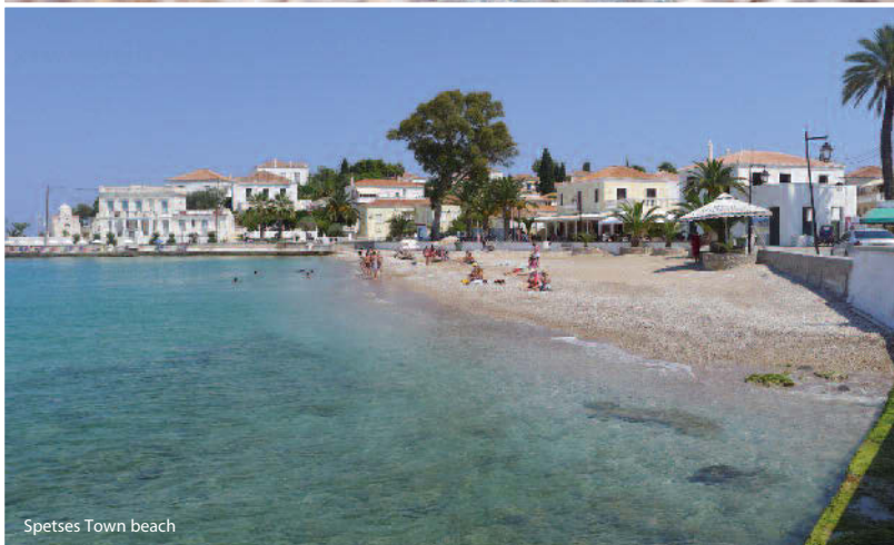
Spetses Town beach