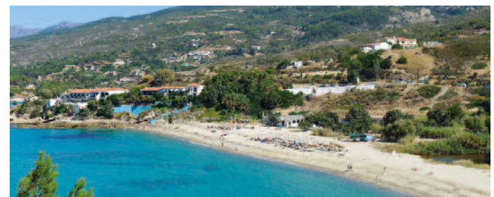
Livadi Beach and location of Valeta Studios (far end)

The Studios: Self Catering Studios for 2/3 Family Units for 4/5 Free WiFi